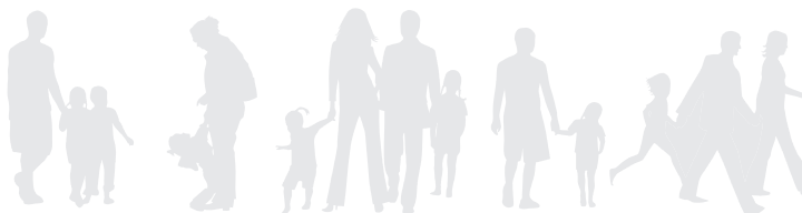
Kids Protection Plan • A Must for Every Mom and Dad • Kids Protection Plan • A Must for Every Mom and Dad