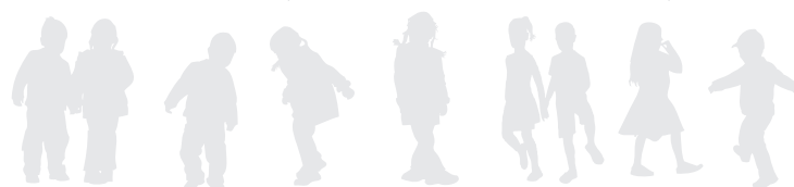
Kids Protection Plan • A Must for Every Mom and Dad • Kids Protection Plan • A Must for Every Mom and Dad