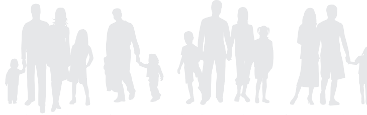
Kids Protection Plan • A Must for Every Mom and Dad • Kids Protection Plan • A Must for Every Mom and Dad

Your Personal Family Lawyer™ will walk you step by step through what would happen to your children and your assets if anything happened to you under your current plan or the state's plan for you. You'll share with your Personal Family Lawyer™ what about that does not work for you and your Personal Family Lawyer™ will help you design a Family Wealth Plan that ensures you make the best decisions for your Family Wealth throughout your lifetime and have a trusted advisor to turn to at every life stage.