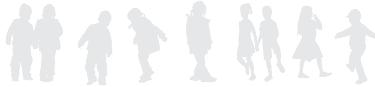
Kids Protection Plan • A Must for Every Mom and Dad • Kids Protection Plan • A Must for Every Mom and Dad