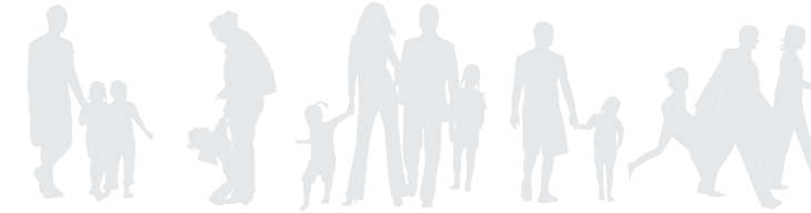
Kids Protection Plan • A Must for Every Mom and Dad • Kids Protection Plan • A Must for Every Mom and Dad