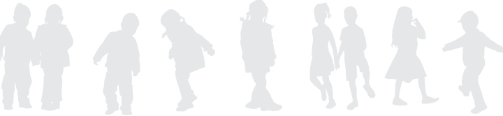
Kids Protection Plan • A Must for Every Mom and Dad • Kids Protection Plan • A Must for Every Mom and Dad