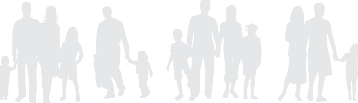
Kids Protection Plan • A Must for Every Mom and Dad • Kids Protection Plan • A Must for Every Mom and Dad