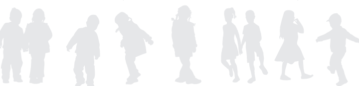
Kids Protection Plan • A Must for Every Mom and Dad • Kids Protection Plan • A Must for Every Mom and Dad